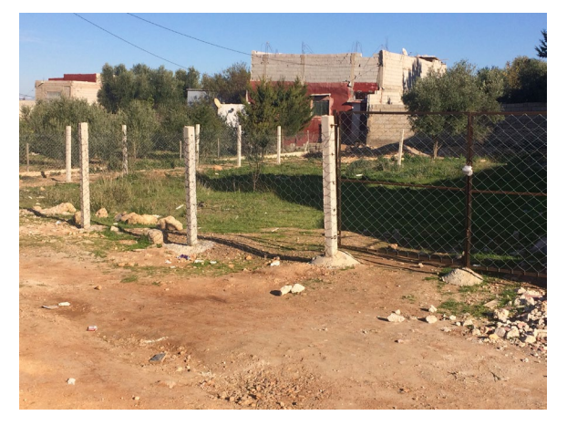
B: ADAPTATIONS IN RISKY SITUATIONS BY MARKING PARCELS

FIGURE 4. THE INHABITANTS' ADAPTATIONS IN RISKY SITUATIONS: A: THE RISING OF NUMBERS OF SLUMS, OLIVE TREES PLANTATIONS AND PARCELS HEDGES AROUND PARCELS IN THE AÏN CHKEF CENTER