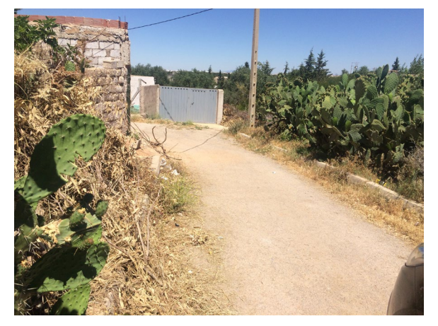
FIGURE 3. THE UNFINISHED ROAD IN THE DOUAR TLALSA, BLOCKING THE RESTRUCTURATION OPERATION LEAD BY THE COMMUNE

Similar situations appear outside the urban pole, at Tlalsa village for example, where the commune is engaged in a restructuration operation where the planned road of the village opening up could not be realized as it faced problems of land status and opposition of land owners (Fig. 3).