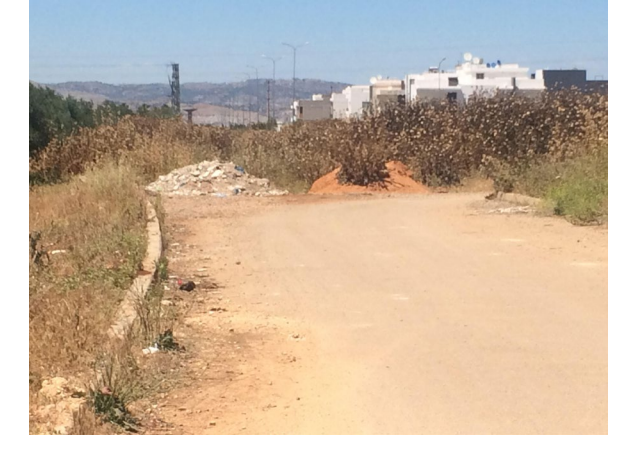
FIGURE 2. BLOCKED ROAD MANAGEMENT IN THE URBAN POLE

pensated by apartments in the modern building constructed by Al Omrane. After the agreement with Al Omrane, the owners have given up their land and, in return, they benefit from modern apartments in the Al Omrane buildings. Concerning farming parcels in the urban perimeter, the olive trees are money compensated.